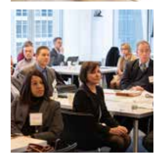
Illustrations / R Edwards